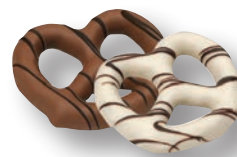
Chocolate Dipped Pretzels