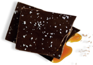
Sea Salt Caramel Chocolate Bar